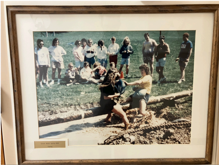
Greek Week 1988

Ashland University's annual Greek Week once again brought together the seven fraternity and sorority chapters on campus for a week of competition, collaboration, and community. The program highlighted the unity of FSL while allowing each chapter to show its spirit through a variety of games and activities. Throughout the week, the chapters participated in a range of events designed to encourage teamwork and friendly rivalry. This year's competition featured several exciting additions, including Just Dance, Pickleball, and Mud Pit Tug-o-War! These new events quickly became favorites among participants and spectators alike, especially Mud Pit Tug-o-War. This event was inspired by a photo of Greek Week 1988 that is displayed on the second floor of the Student Center. Bringing back this event showcases FSL's ability to connect alumni traditions to improve on our current Greek Week events!