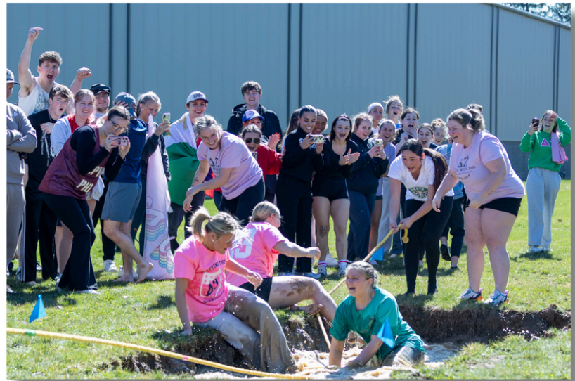
Greek Week 2026

Alongside these competitive events, Greek Week also included our pillars of scholarship and service! Throughout the week, IFC and Panhel hosted study tables for members of FSL to attend to make sure the busyness of the week did not interfere with our academic achievement. We also raised $871 to donate to St. Jude Children's Research Hospital and donated two carloads of food to the Ashland Kroc Center! After the events concluded, Theta Phi Alpha emerged as the overall champion among the sororities, demonstrating strong performances across multiple events. On the fraternity side, Phi Kappa Psi claimed the top spot, earning the overall victory through consistent teamwork and determination. Phi Psi's victory marks the 13 th year in a row that the chapter has won Greek Week! This program continues to be one of the most anticipated traditions on campus, giving students the opportunity to connect with members from other chapters, build lasting friendships, and celebrate the shared values of Ashland University's Greek community!